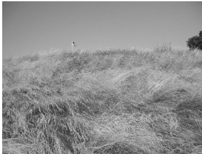
Can you find Adrian Machado's Titleist

Range Discount: 20% off all range purchases. With pre-paid purchase