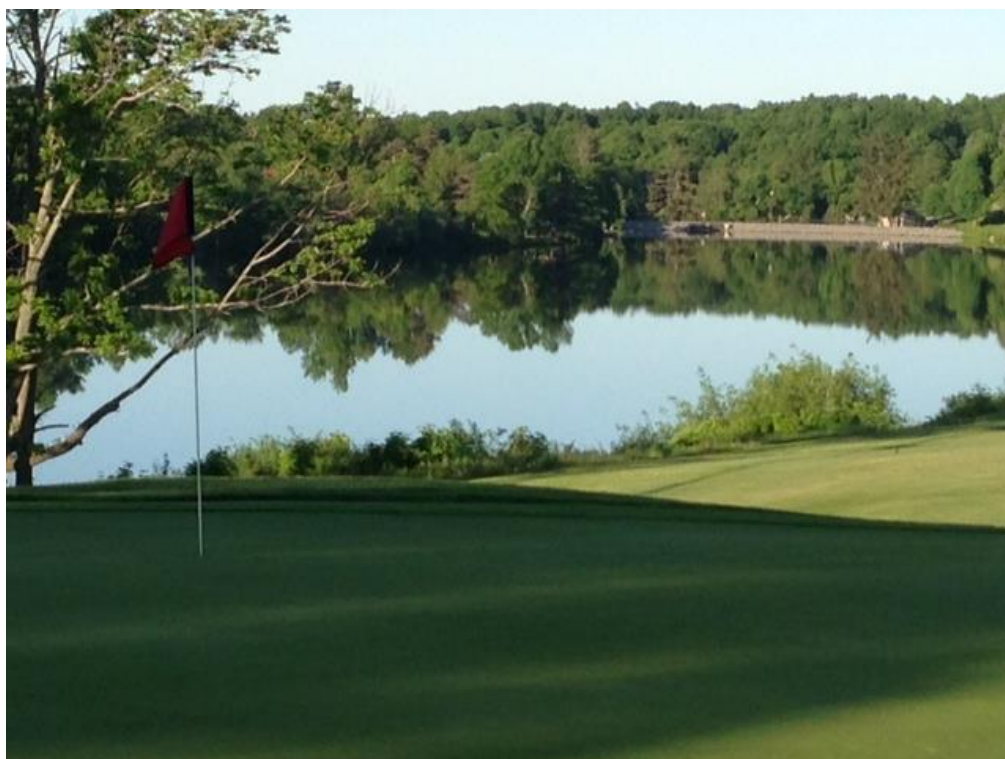
(9 th Green)